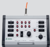
Remote control VT 780-2 FB