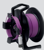
VT 34 SKT