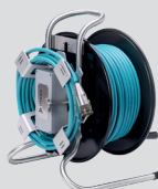
VT 72 HD SKT