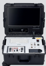
Control unit VT 6360 CU