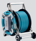
VT 780 SKT